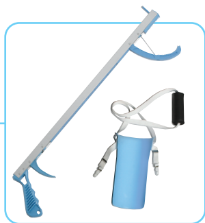
Aids to Daily Living (ADLs)