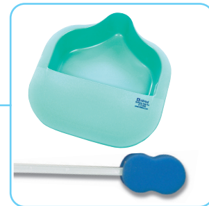
Bathing and Toileting

*Any order placed before 3 p.m. EST, if in stock, ships the same day!