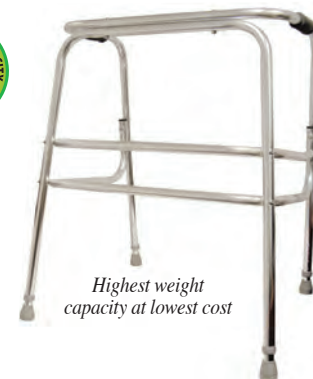
Highest weight capacity at lowest cost