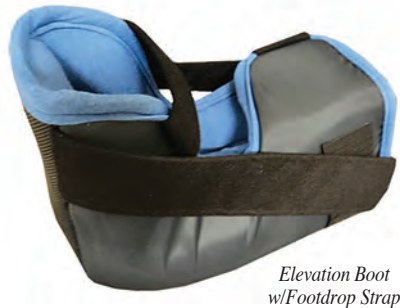
Elevation Boot w/Footdrop Strap