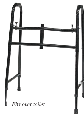
Fits over toilet