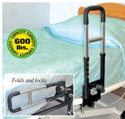
Folds and locks

Additional freight charges apply if shipped by air.