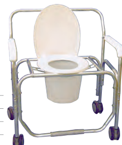
Standard Seat w/Pail