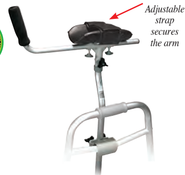
Adjustable strap secures the arm