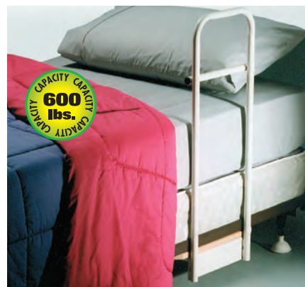
Rail extends to floor for greater support