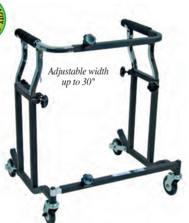
Adjustable width up to 30"