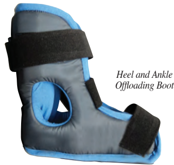
Heel and Ankle Offloading Boot