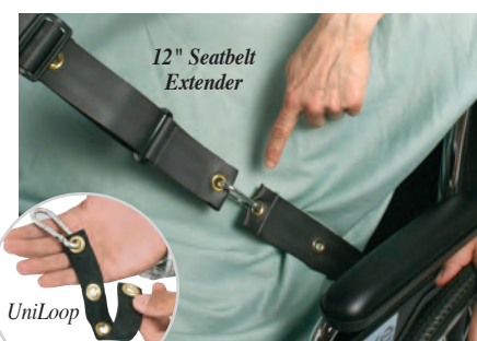
12" Seatbelt Extender