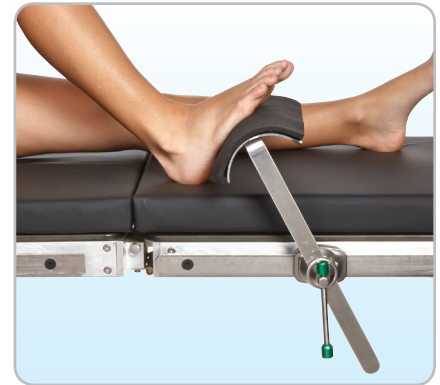
#934396 TKR Footrest