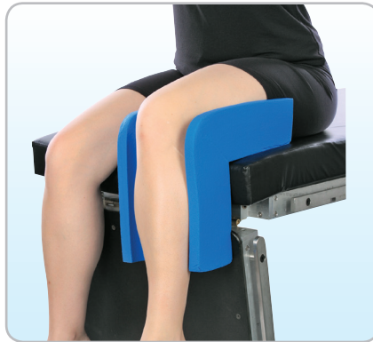
#931939 Arthroscopic Reusable Vinyl-Coated Well-Leg Holder