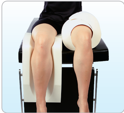
#931962 Arthroscopic Single-Use Well-Leg Holder and Knee Kit