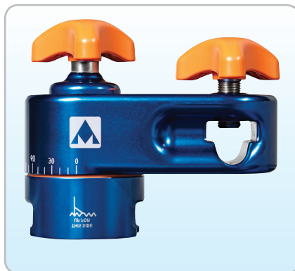
#937932 FREEDOM® 360 Socket Table Clamp