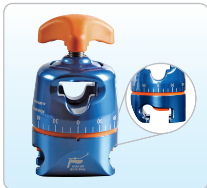
#934725 FREEDOM® Clark Socket Table Clamp