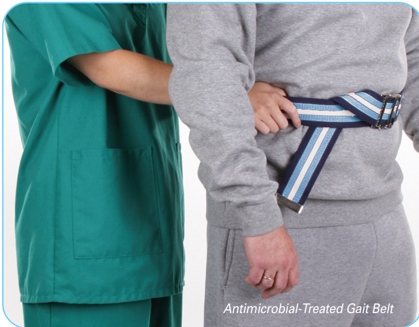
Antimicrobial-Treated Gait Belt