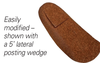
Easily modified – shown with a 5° lateral posting wedge

Best for: use as a component in more elaborate orthotics