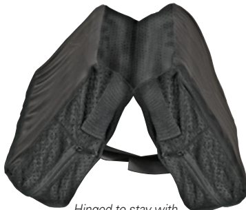
Hinged to stay with chair when folded