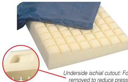
Underside ischial cutout: Foam is removed to reduce pressure