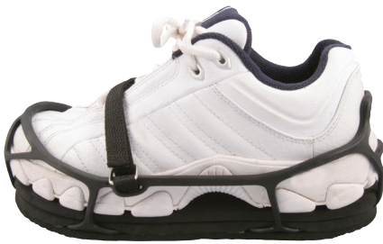
Two-layer oversole adjusts height