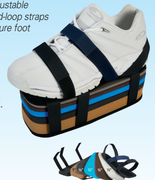
Five color-coded foam lifts for easy identification of height

Any order placed before 3 p.m. EST, if in stock, ships the same day! Prices, product availability, and specs are subject to change.